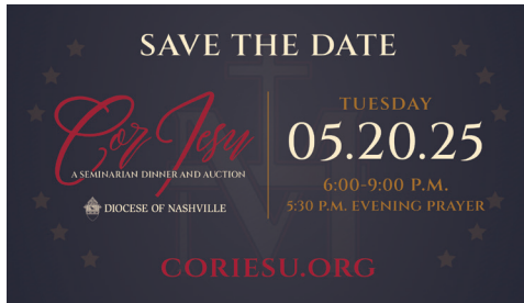
SAVE THE DATE